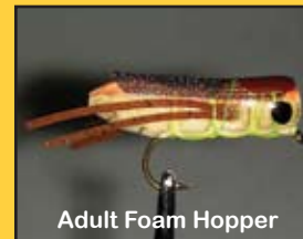
Adult Foam Hopper