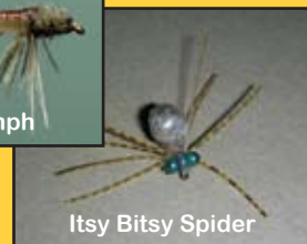
Itsy Bitsy Spider